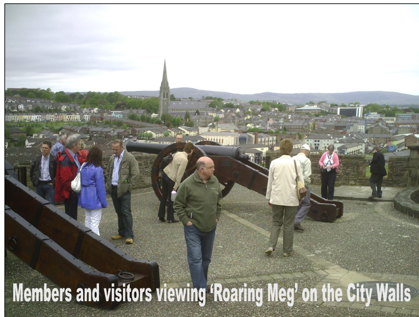
Members and visitors viewing 'Roaring Meg' on the City Walls

On Saturday 10 th May Edenderry Community Development Association added a very successful outing to historic 'Derry to their list of achievements to date. A full coach left the Fairgreen at 8.30 am and we had morning coffee in the Mid-Ulster garden centre on our way