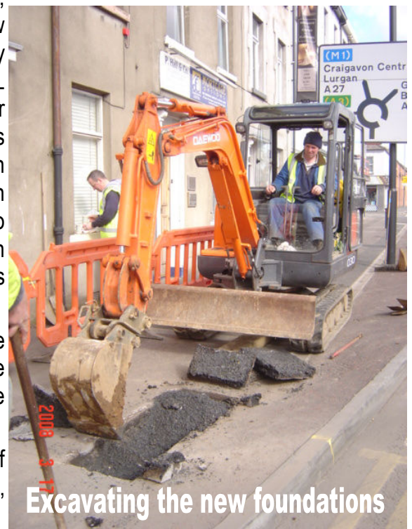
Excavating the new foundations

This event is a major historic community event in the life of Edenderry and opened to ALL regardless of race, political affiliation, nationality or religious persuasion.